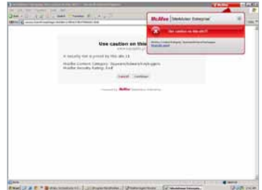
Figure 3. McAfee SiteAdvisor Enterprise blocks access to unwanted websites based on custom blacklists and whitelists.

McAfee Web Filtering for Endpoint is an optional add-on to McAfee SiteAdvisor